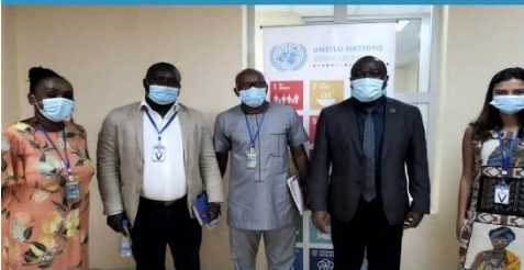
SIERRA LEONE: UN RESIDENT COORDINATOR SUPPORTS UNIMAK'S PHDS IN EDUCATION AND SUSTAINABLE DEVELOPMENT

The move is to salvage the much needed desire for spacious and smart classrooms with a view to promoting academic excellence.