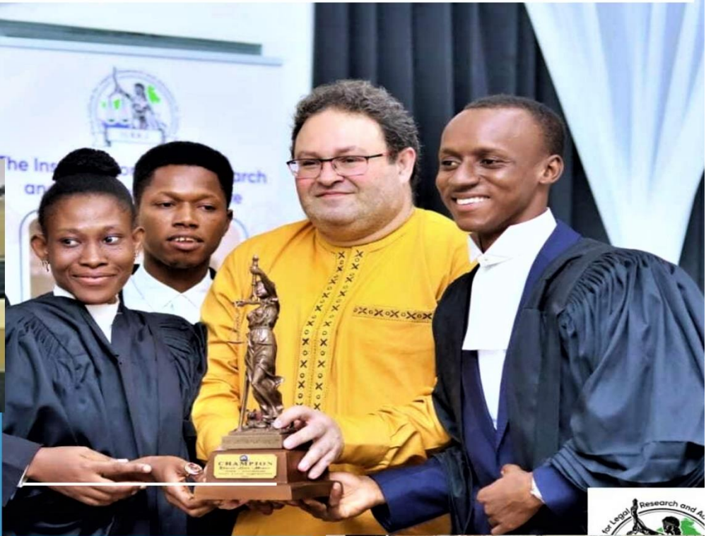
UNIMAK WINS THE INTER-COLLEGIATE MOOT COURT COMPETITION

The RC said that the added doctoral courses to the university's curriculum demonstrate the ability of UniMak to adapt to new trends and understand gaps and opportunities in the development of the country.