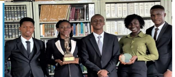
UNIMAK EMERGES AS THE BEST REGIONAL TEAM- AFRICA IN THE ICC MOOT COURT COMPETITION.