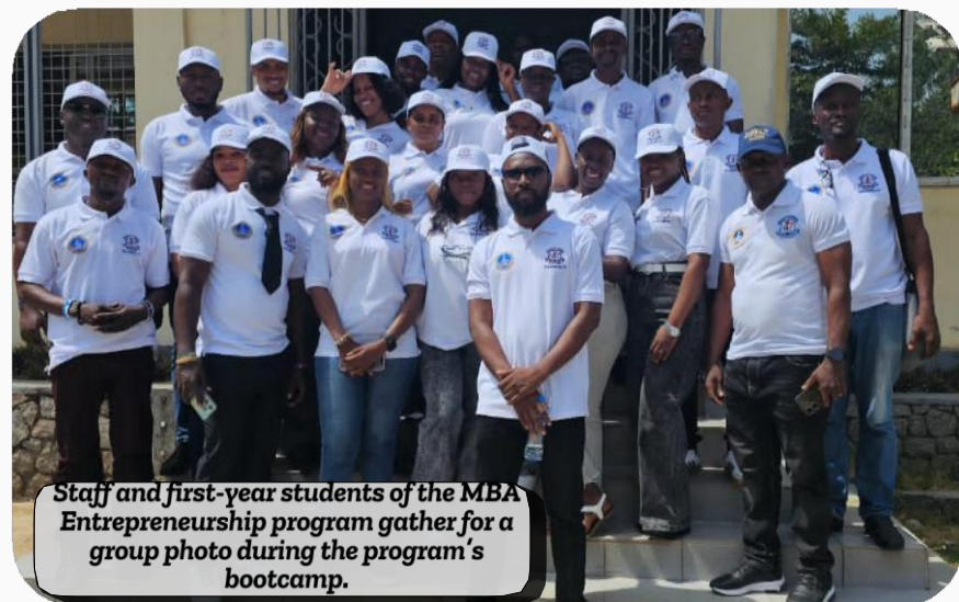
Staff and first-year students of the MBA Entrepreneurship program gather for a group photo during the program's bootcamp.

As Sierra Leone continues to embrace innovation and economic development, the MBA Entrepreneurship program at the University of Makeni stands at the forefront of equipping aspiring business leaders with the skills and knowledge needed to drive change. Through expert-led training and mentorship, the program is shaping the next generation of entrepreneurs poised to make a lasting impact.