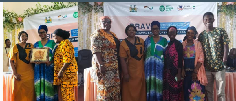
The UNIMAK team poses for a group photo with the organizers of the BRAVE Project launch.

UNIMAK's participation in the BRAVE Project reaffirms its commitment to promoting a culture of respect, safety, and empowerment within its academic community and beyond.