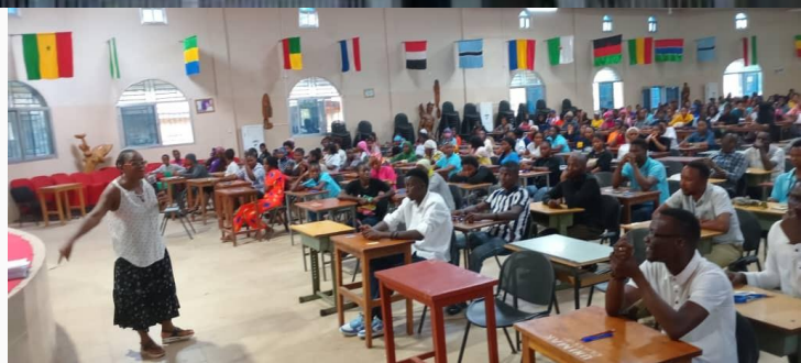
UNIMAK students diligently sit for their first semester examinations in the university auditorium under the supervision of the Chief Examiner, ensuring a smooth and fair assessment process.

The exams will run for several weeks, covering diverse courses. UNIMAK continues to uphold academic excellence, ensuring a smooth and fair examination process.