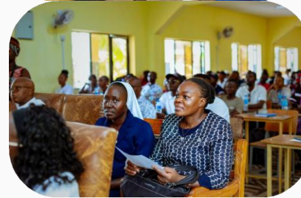
Dignitaries, organizers, faculty, and attendees at the launch of the Centre of Excellence for Maternal and Child Health Education at UNIMAK's Yoni Campus, celebrating a milestone in promoting maternal and child healthcare in Sierra Leone.