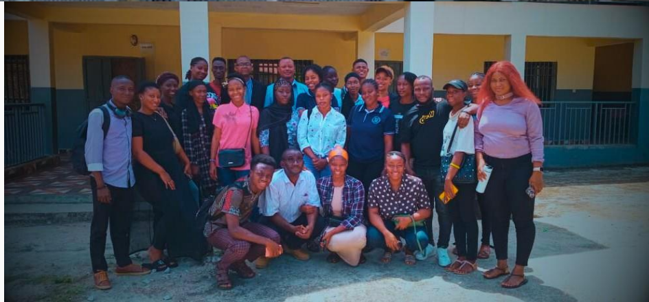
UNIMAK Mass Communication staff, invited guests, and final-year students gather for a group photo after the 'My Freedom Day' event.

Makeni, Sierra Leone—March 11, 2025 The final-year Mass Communication students at the University of Makeni successfully marked the 9th edition of CNN's 'My Freedom Day' on March 11, 2025. Held in the department's virtual classroom, the event aimed to raise awareness about modern-day slavery and human trafficking, aligning with CNN's global campaign.