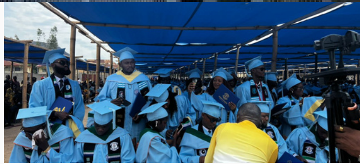
A cross-section of the 401 female graduates celebrates their achievement at UNIMAK's 13th Convocation Ceremony, marking a milestone for women's advancement in higher education in Sierra Leone.

The presence of a strong female graduating cohort highlighted the university's ongoing commitment to inclusivity, leadership, and equal opportunity in education.